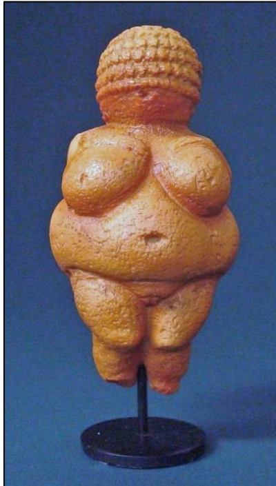
Venus of Willendorf